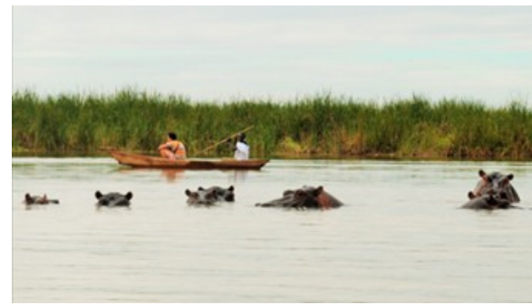
Canoeing in Lake Jipe

Last but not least, TATU Adventures managed to get a partner in Zanzibar that organizes airport pick-ups, guided tours, different activities and bookings for the hotels. This partnership has worked very well until the end of the year and so far 11 of our clients could already enjoy the island.