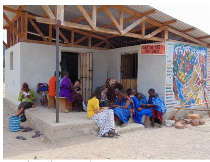
During the weekly meeting, July 2017

Masaa is a personal and economic empowerment project specifically for the Masai Women of Kazi na Sala. The project aims to promote selling traditional Masai jewelry as an alternative source of income and to provide the women with a basic education in small business practices. 2017, 13 women participated and collectively they saved more than 5000,000 Tanzanian shillings (€2300) through this initiative.