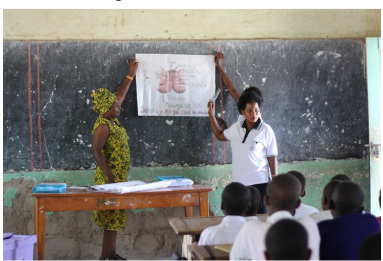
Menstrual health seminar at Kiruani school, July 2017

TATU Project continues to help Kilipads communicate with partners, manage sales and navigate the TBS certification process. We look forward to a strong and independent Kilipads Enterprises in the near future.